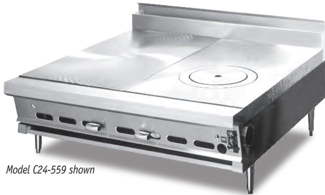
Model C24-559 shown