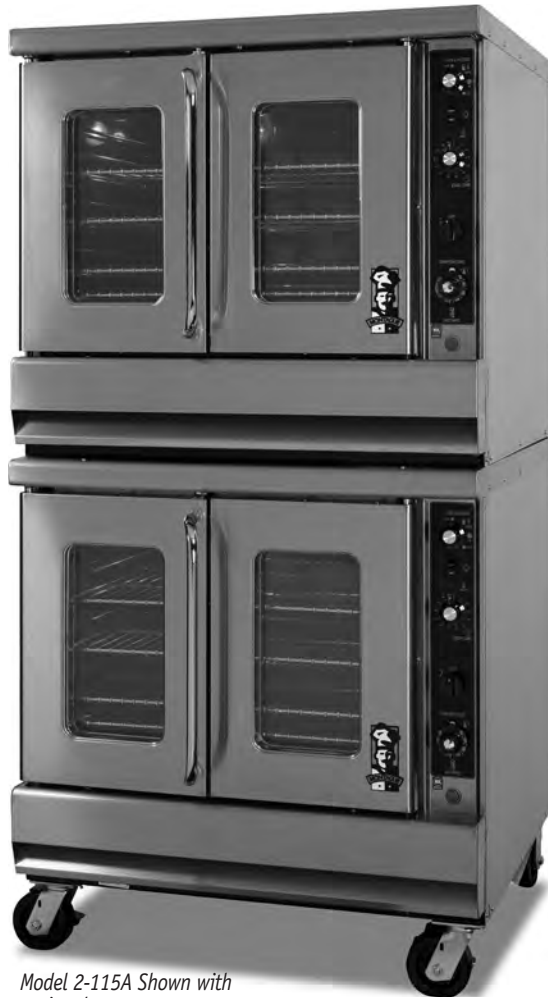
Model 2-115A Shown with optional casters.