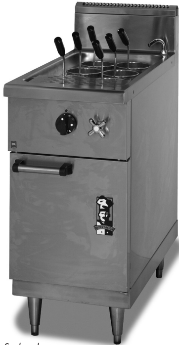
Model CPG-1 Pasta Cooker shown with optional round baskets