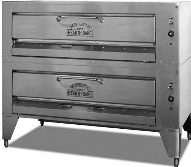
Model 24P-2 Shown with standard stainless steel front and 15" (381 mm) gusset-style legs.