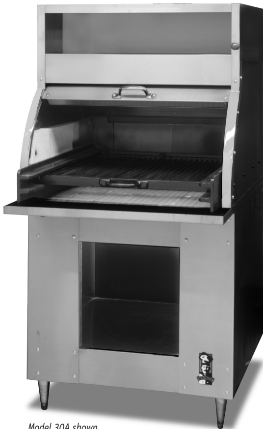
Model 30A shown