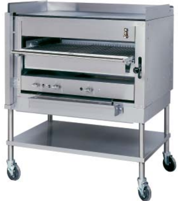
C45 Steakhouse Broiler (shown w/ optional casters)