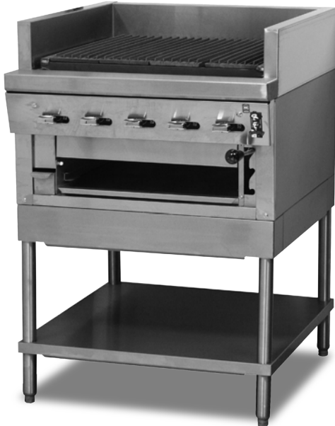
Model UFSM-30R shown