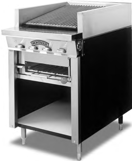
Model UF-24R shown, with optional lower warming rack