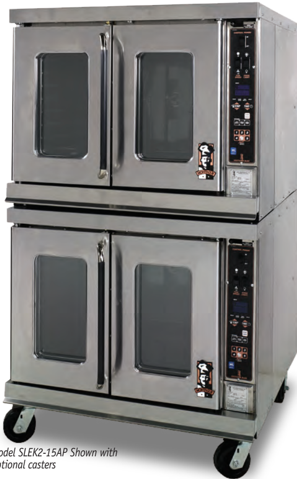
Model SLEK2-15AP Shown with optional casters