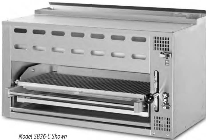
Model SB36-C Shown