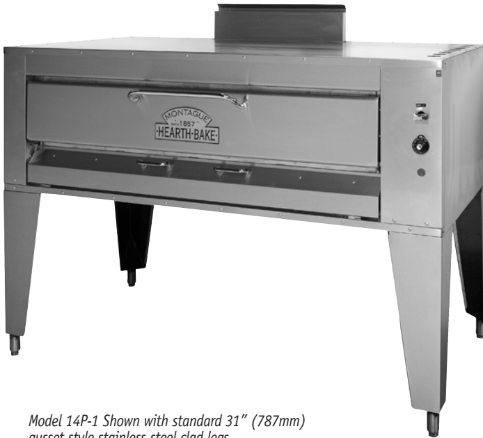
Model 14P-1 Shown with standard 31" (787mm) gusset-style stainless steel clad legs.