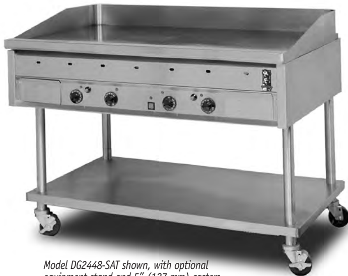
Model DG2448-SAT shown, with optional equipment stand and 5" (127 mm) casters