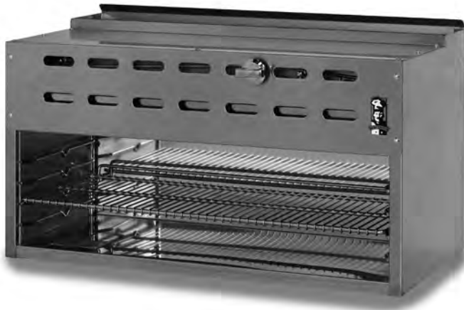
Model CM36 Shown