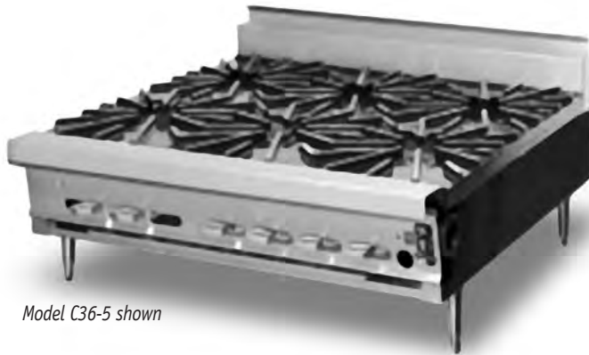
Model C36-5 shown