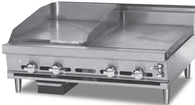
Model C36-12E shown