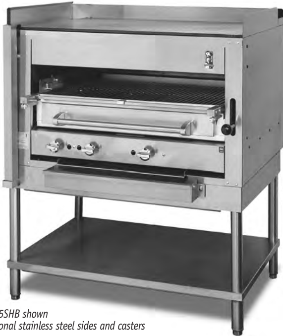
Model C45SHB shown with optional stainless steel sides and casters