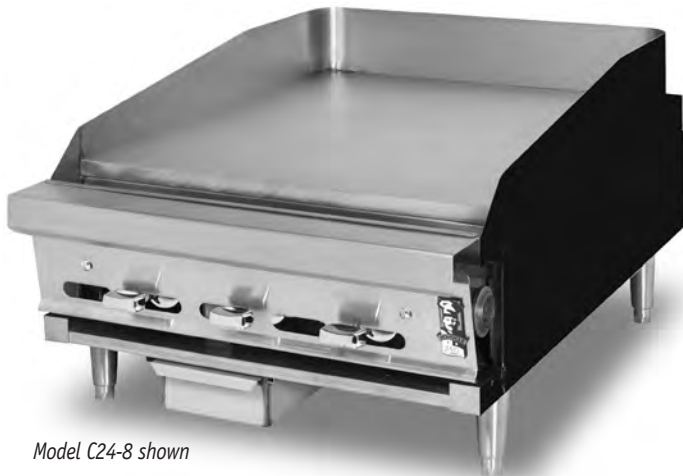
Model C24-8 shown