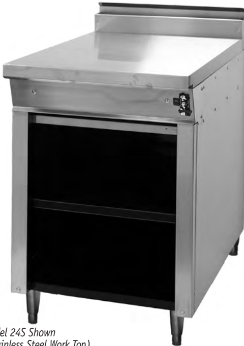
Model 24S Shown (Stainless Steel Work Top)