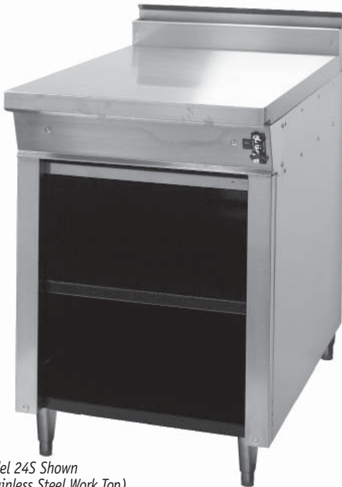
Model 24S Shown (Stainless Steel Work Top)