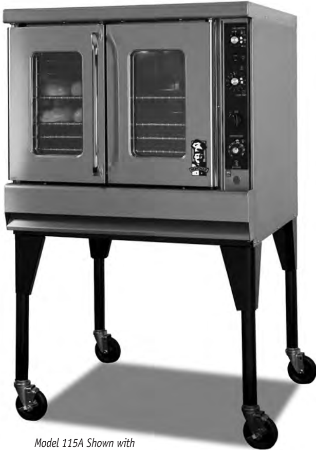
Model 115A Shown with optional casters