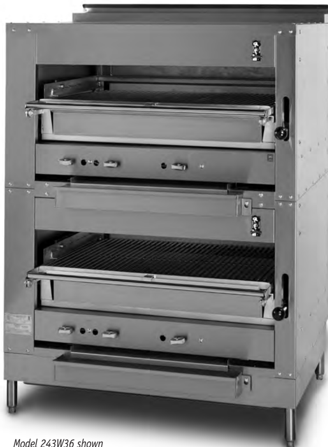
Model 243W36 shown