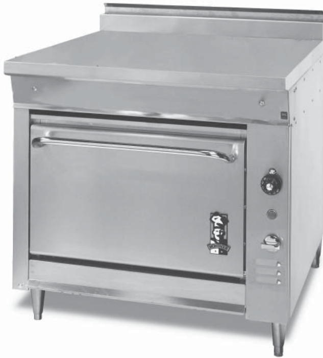
Model 136S shown