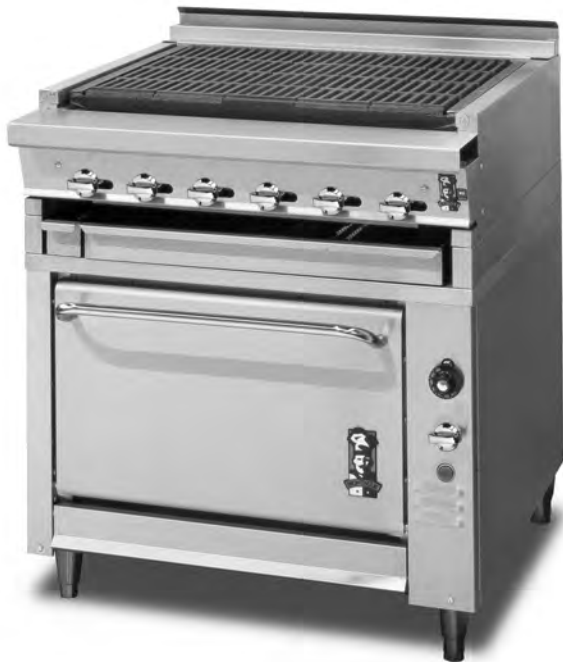
Model 136LB shown with UFLC-36R